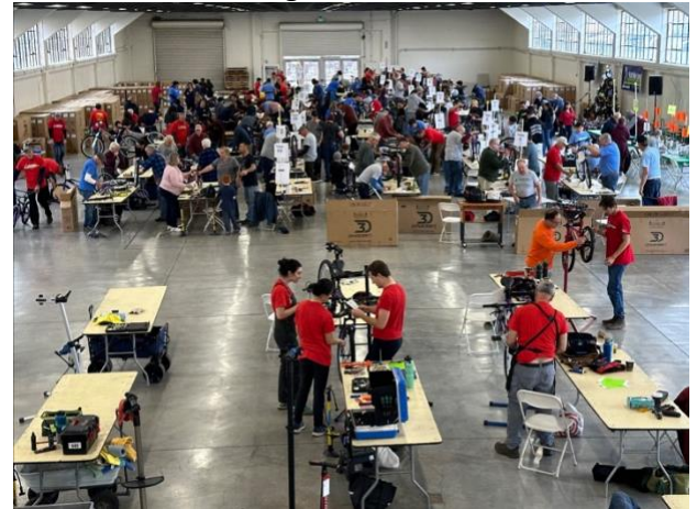
More Photos on this link! <a href="https://share.icloud.com/photos/010xp">https://share.icloud.com/photos/010xp</a> <a href="BzaH3RFxPPMKXPQFUHfA">BzaH3RFxPPMKXPQFUHfA</a> <a href="mailto:">"Making Dreams Come True"</a>

Look close to the right and see our team!