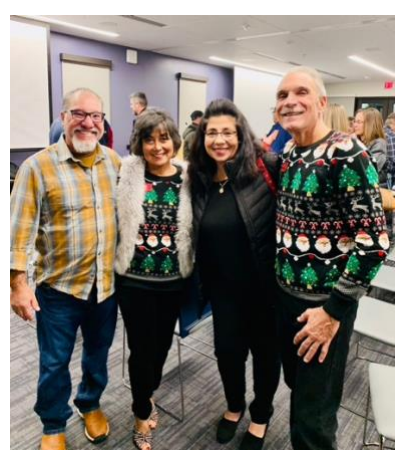
A relative of mine