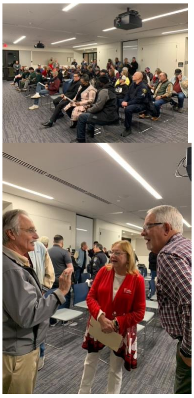
The Mayor was thrilled