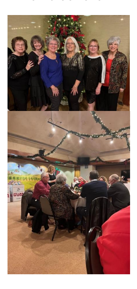
Toys for Tots Collected 2 full bins and $500 was donated to the Open Heart Kitchen from the Holiday Party Guests!